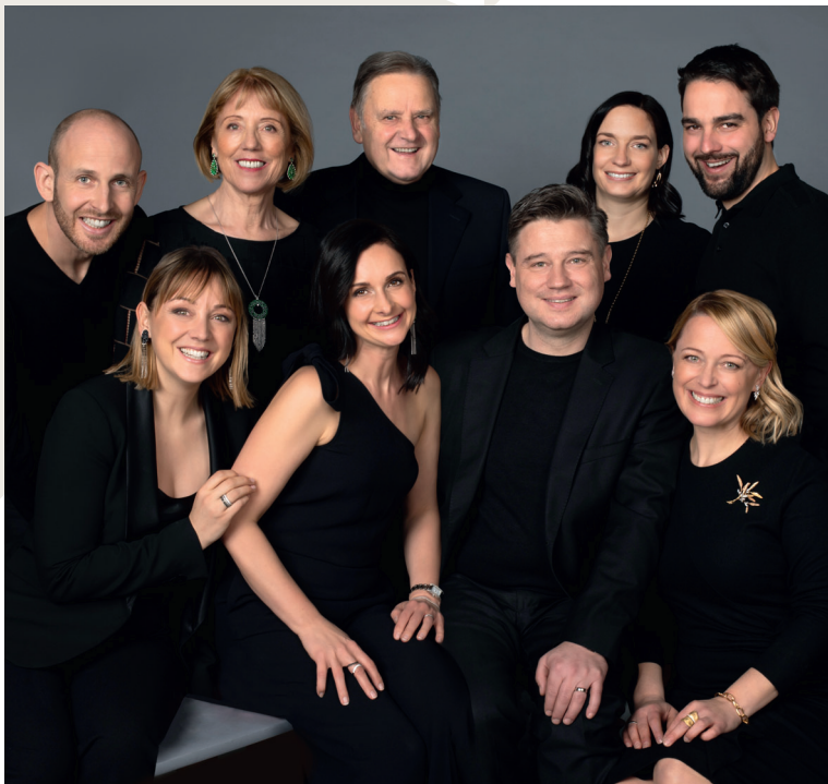
A family with a passion for jewelry

Looking to the Future: The Gamper family’s multi-generational team is well-prepared for the years ahead. Creativity, innovation, and contemporary design not only define the artistic creations but also embody the philosophy of Tiroler Goldschmied. The company remains a shining example of the perfect harmony between tradition and modernity.