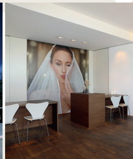
Wedding jewelry store in Scena, 2006