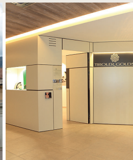
Shop in the Quellenhof Luxury Resort, 2013

A Family Business Rooted in Tradition and Forward Thinking: One of the key success factors is the company’s management as a family business. The passion for exquisite jewelry and innovative design is passed down from generation to generation. All four children and three in-laws contribute their individual expertise as goldsmiths, jewelry designers, gemologists, and diamond graders to the company.