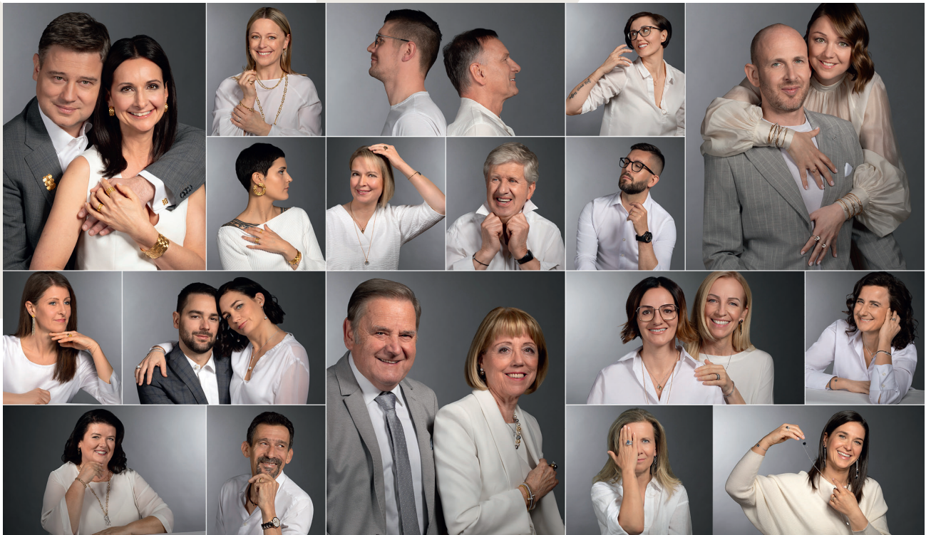
The Tiroler Goldschmied Team