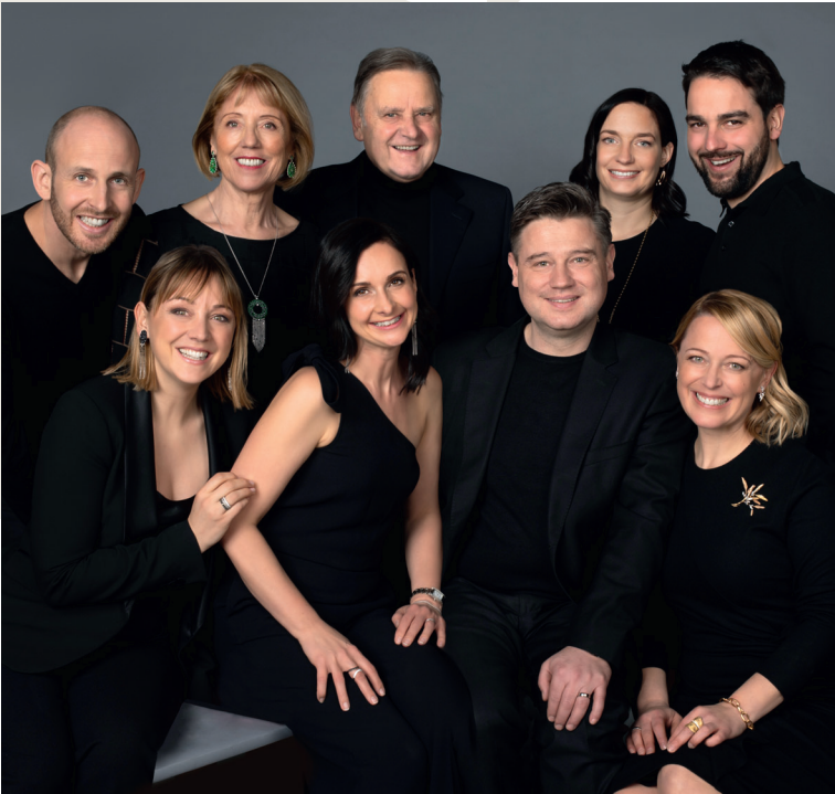
A family with a passion for jewelry