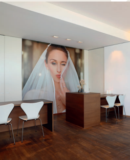
Wedding jewelry store in Scena, 2006