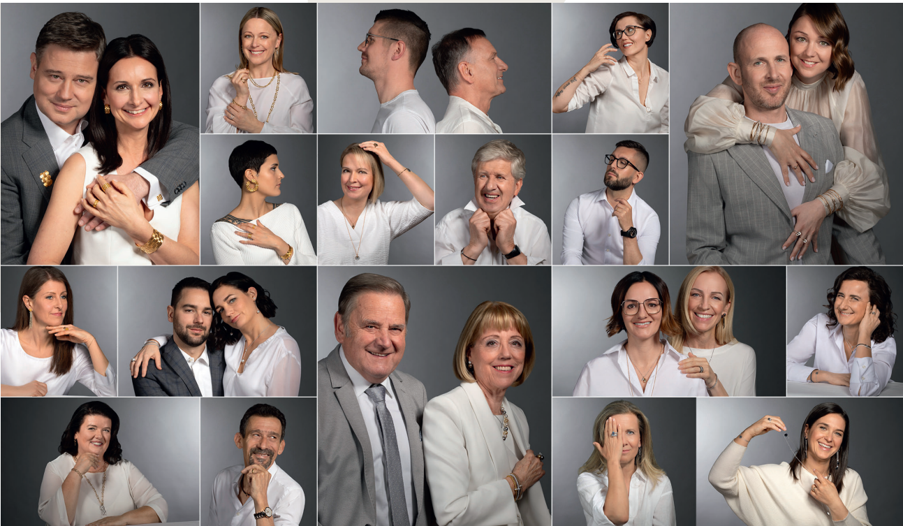
The Tiroler Goldschmied Team