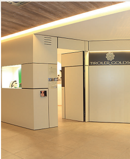
Shop in the Quellenhof Luxury Resort, 2013

A Family Business Rooted in Tradition and Forward Thinking: One of the key success factors is the company's management as a family business. The passion for exquisite jewelry and innovative design is passed down from generation to generation. All four children and three in-laws contribute their individual expertise as goldsmiths, jewelry designers, gemologists, and diamond graders to the company.