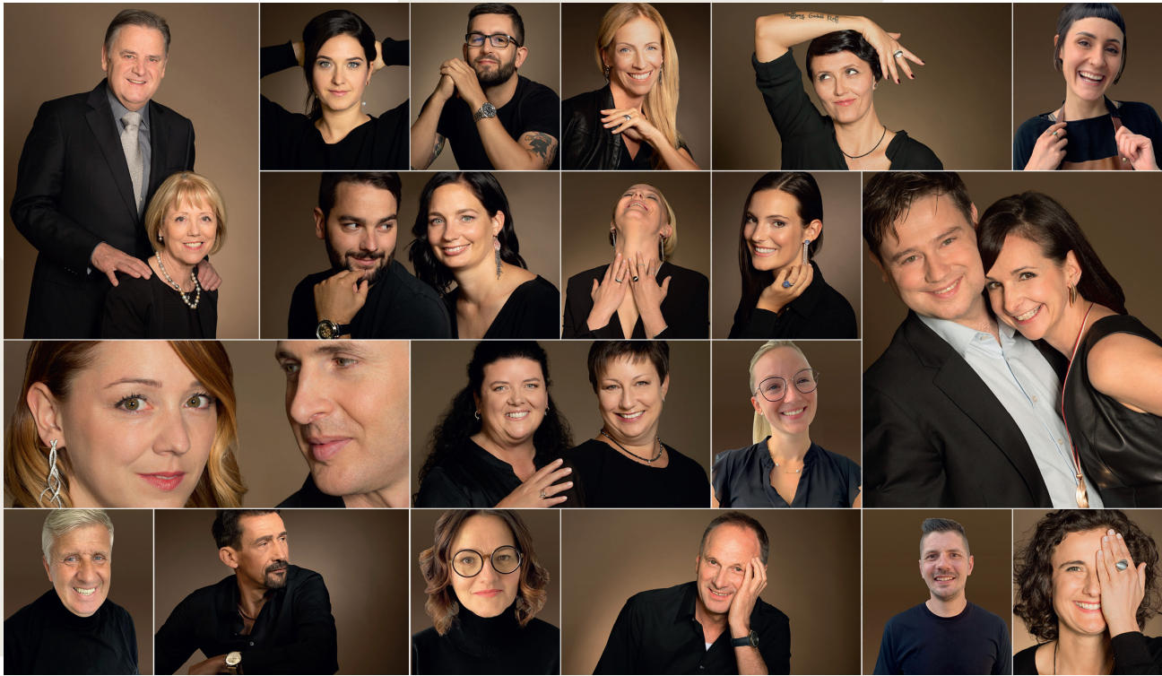
The Tiroler Goldschmied Team